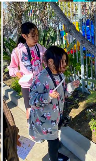
In the spirit of education and wellness, families from Vermont Manzanita in Los Angeles enjoyed an afternoon nature walk with the Wildwoods Foundation. The intergenerational group learned about birds, insects, plants and how to use a compass.