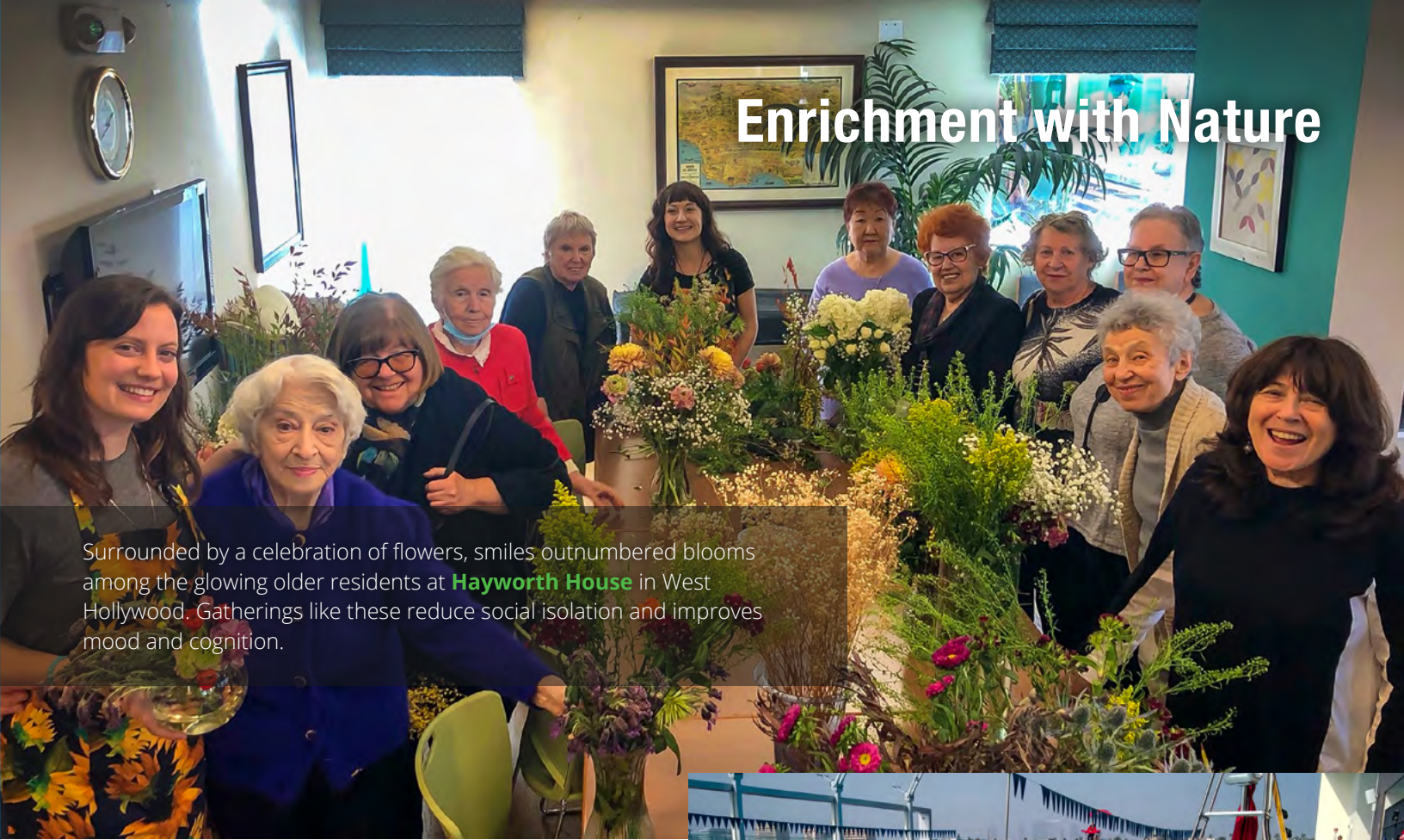
Surrounded by a celebration of flowers, smiles outnumbered blooms among the glowing older residents at Hayworth House in West Hollywood. Gatherings like these reduce social isolation and improves mood and cognition.